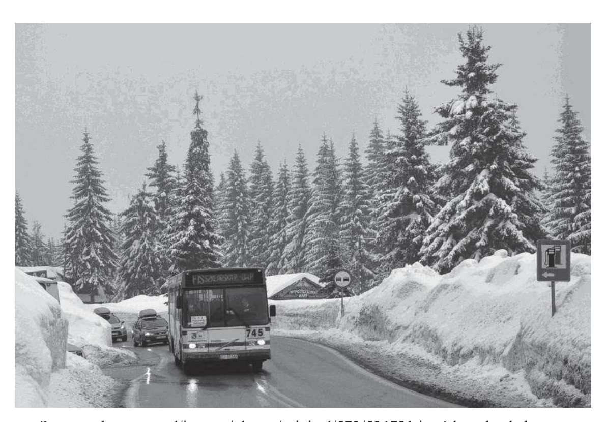
FIG. 2: The Cross-border road E65 in Jakuszyce (880 m a.s.l.) in the winter